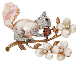
Ruser - A cultured freshwater pearl, diamond and colored diamond brooch