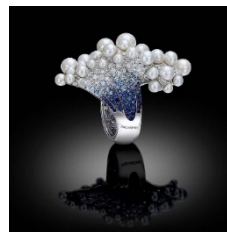
Palmiero - ring with graduated blue sapphires and topped with a foam of bubbling pearls.