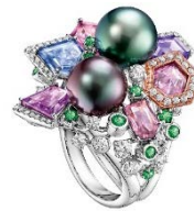
Chow Tai Fook - Ring in 18k white gold with South Sea peacock pearls, pink and purple sapphires, green garnets and white diamonds.